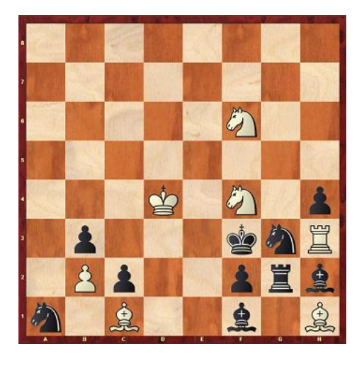
Mate in 14