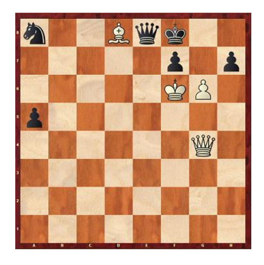
Mate in 13