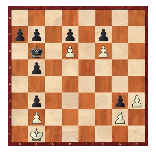
Mate in 13