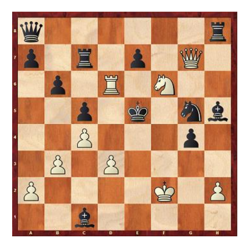
Mate in 14