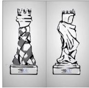
NEW TROPHIES FOR EUROPEAN CLUB CUP 2016