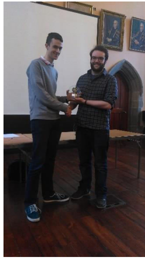
Second: Yours truly